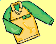
it's often cool