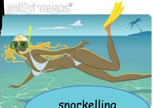
snorkelling scuba diving