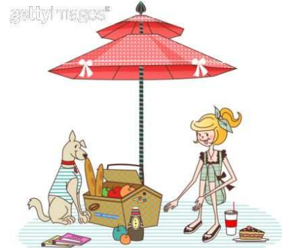
having a picnic